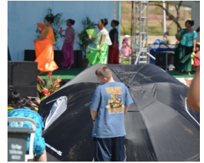
Don't be this person! They are right up front and no one can see the stage without standing.